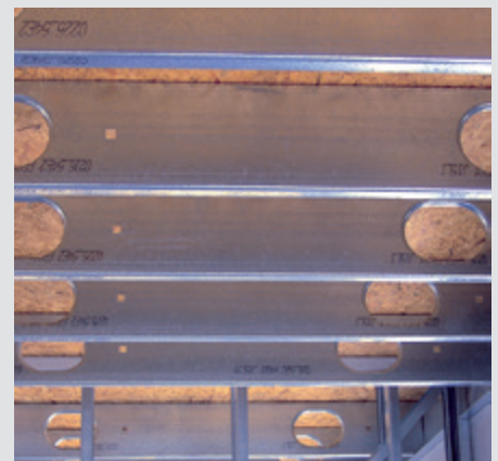
Light steel floor joists with large stiffened web openings