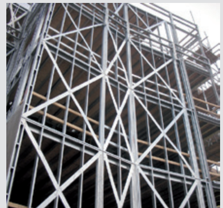
Cross bracing designed to provide stability of light steel framing