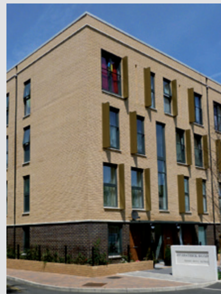
Brickwork external cladding on light steel frame building